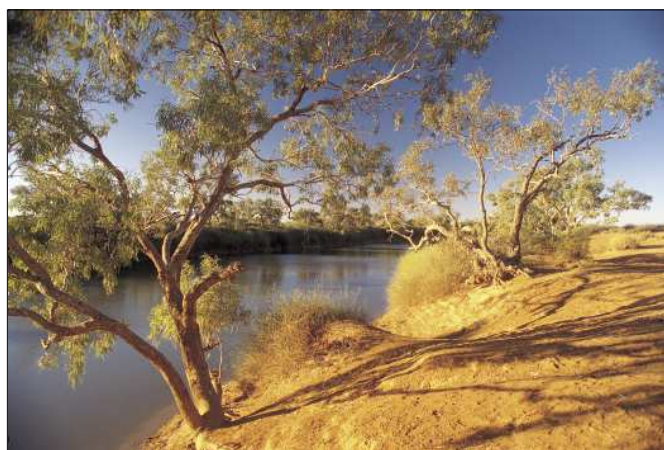
Pictured above left: The Bungle Bungles. Pictured above right: The Cooper Creek, on the 'Following Burke & Wills' Tour