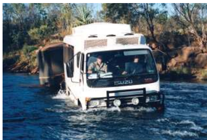
Above: One of our modern vehicles

Accommodation is available at the Tropicana Resort in Broome before the tour, just advise on booking and we can arrange it. Accommodation is also available at Darwin, for those who require it.