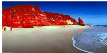
Above: Magnificent Cape Leveque