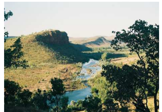
El Questro pictured at right

BOOKINGS: Can only be confirmed with the payment of $250 deposit. Final payment falls due 45 days before departure. Cheques are to be made payable to 'Outback Track Tours Pty Ltd'. We also accept VISA, MASTERCARD and BANKCARD. All credit card transactions over $250.00 will attract a 3% fee. TRAVEL INSURANCE: We strongly recommend travel insurance against loss of possessions, accident and cancellation through unforeseen circumstances. Insurance is available at the office. PLEASE NOTE: This is a camping tour, except when staying in accommodation at Kununurra. Cabin accommodation is available at some of the places where we camp, a refund is not given for unused camping portion if you choose to stay in accommodation. If weather, road conditions or other circumstances necessitate a change in itinerary, the decision to make such changes is solely that of the Tour Guide.