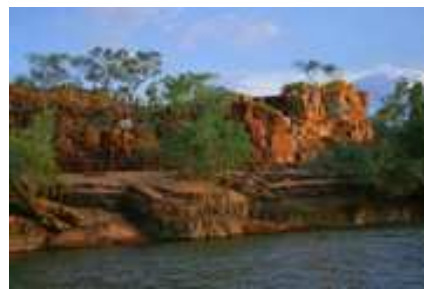
Above: Rocks and cliffs line the River upstream from the Camp at Kingfisher Camp